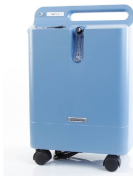
PHILIPS 5 Ltr Oxygen Concentrator