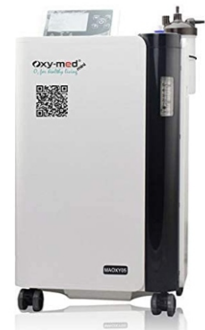
Oxy-Med 5 Ltr Oxygen Concentrator